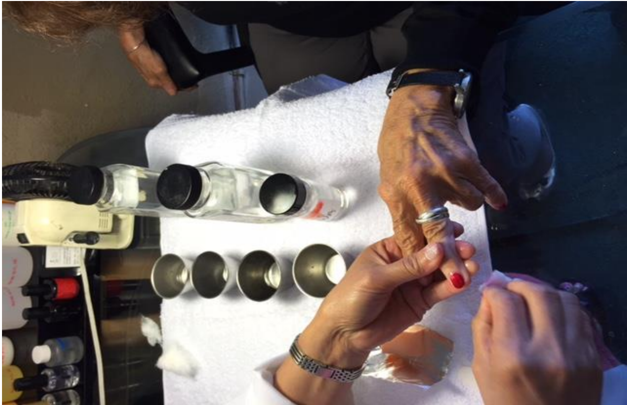
Figure 3-9. Testing Alternatives for Regular Polish Removal at Salon