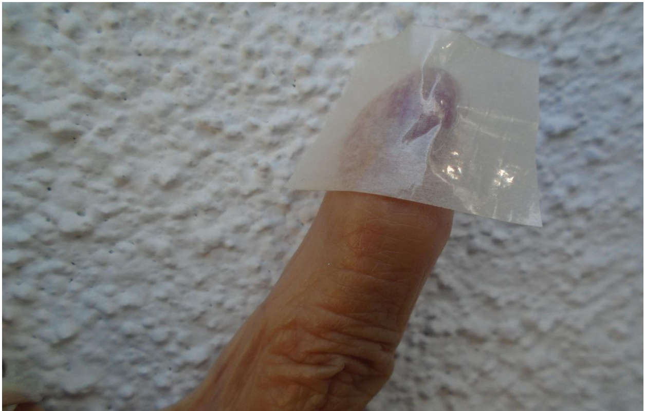
Figure 4-3. Permacel Tape Applied to Base/Color Coat for Adhesion Testing