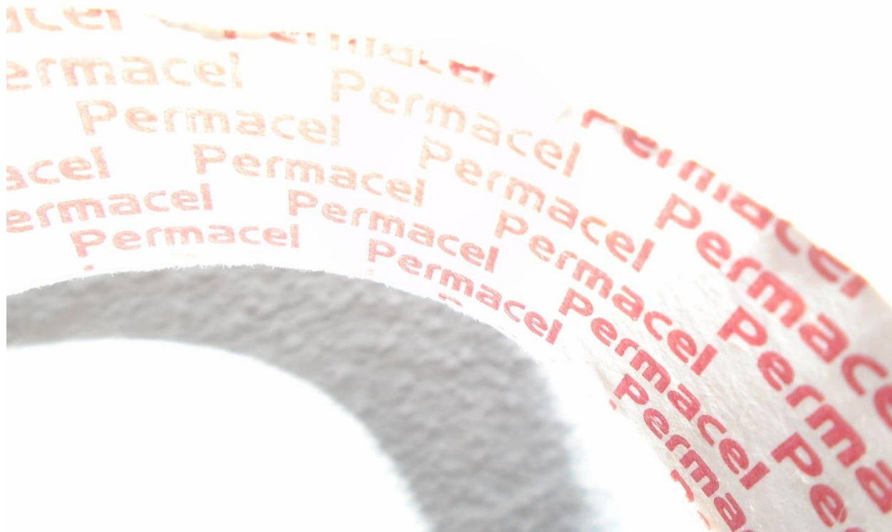
Figure 4-1. Permacel Tape Used in Adhesion Testing

colored base coat which would show up on the tape if a residue was left on the surface. IRTA prepared the four nails in the same manner again and applied the base/color coat and let it cure overnight.