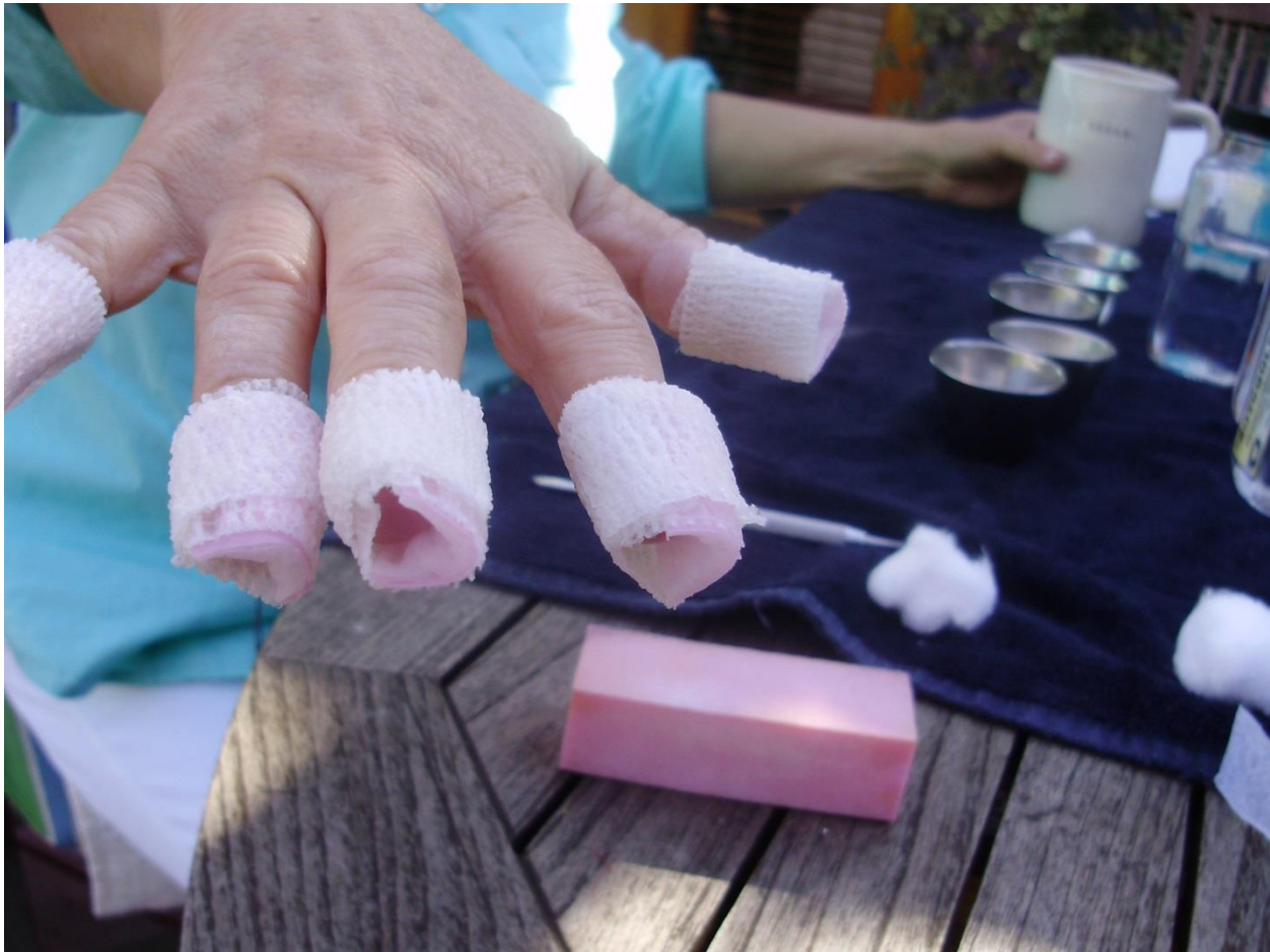
Figure 3-3. Tests of Alternatives for Gel Polish Removal with Consumers

IRTA conducted testing with two women who constituted the second consumer group on both gel light cured polish and regular polish. Both had the two types of polish on their hands and feet. Pictures of the tests that were conducted are shown in Figure 3-3 through 3-6. For the regular polish, the two consumers indicated that both blends worked extremely well. They used the tool for removal of the gel light cured polish after it had been softened by the two blends. Both of them indicated that they would use the tool for the removal and did not view it as a disadvantage. Both of them also mentioned they liked the way it made the nails feel in contrast to the feel of the nails with traditional remover. A distinct advantage seemed to be that the nails were not as dried out and brittle as with traditional acetone remover.