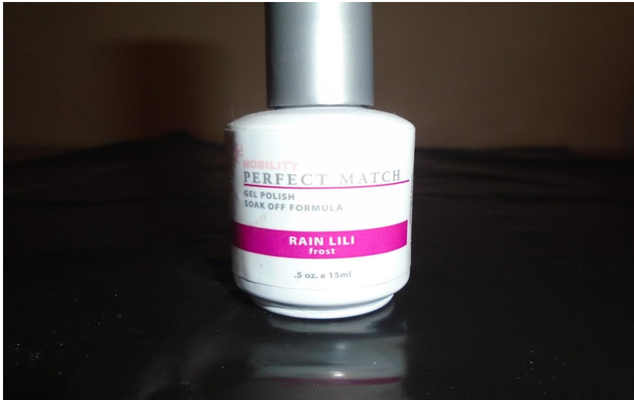
Figure 2-2. Opaque Bottle of Ultraviolet Light Cured Gel Polish Color Coat