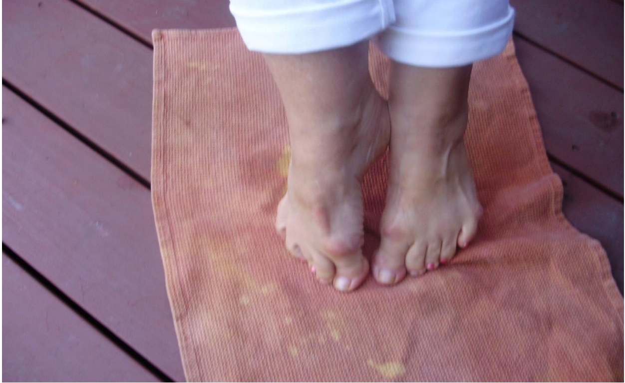
Figure 3-4. Tests of Alternatives for Regular Polish Removal with Consumers