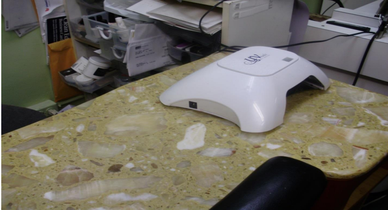
Figure 2-4. Typical UV Light Used to Cure Gel Polish in a Salon