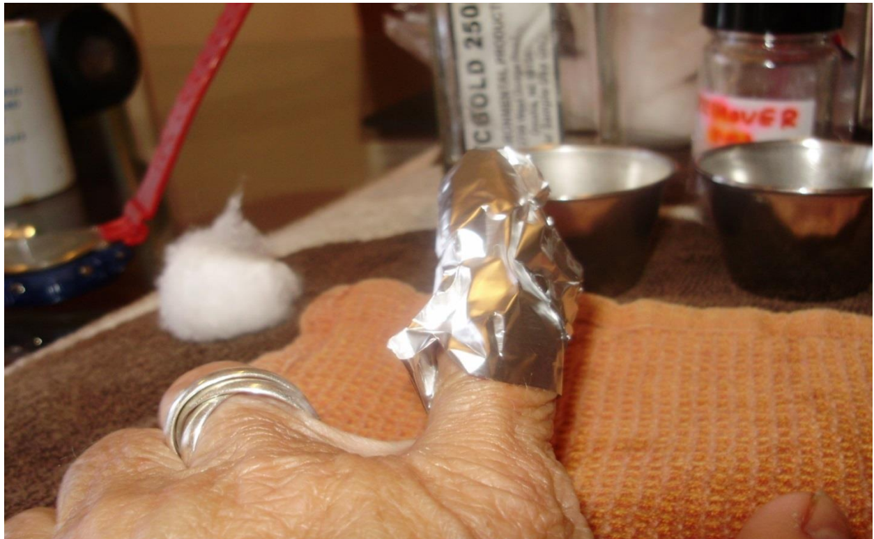
Figure 2-9. Foil Wrapped Nail for Removal of Gel Polish During Testing