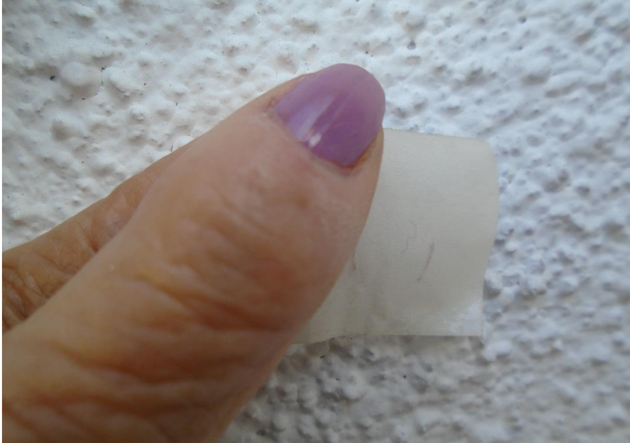
Figure 4-4. Residue Left on Permacel Tape from Adhesion Testing

Because the candidate alternatives are blends of acetone, a fast evaporating solvent, and a low vapor pressure slow evaporating solvent, IRTA was concerned that selective evaporation would occur. This means that the acetone could evaporate from the mixture selectively and the remaining formulation would lose some of its effectiveness over time. What this indicates is that it is important to use the removers in a container that allows only minimal evaporation.