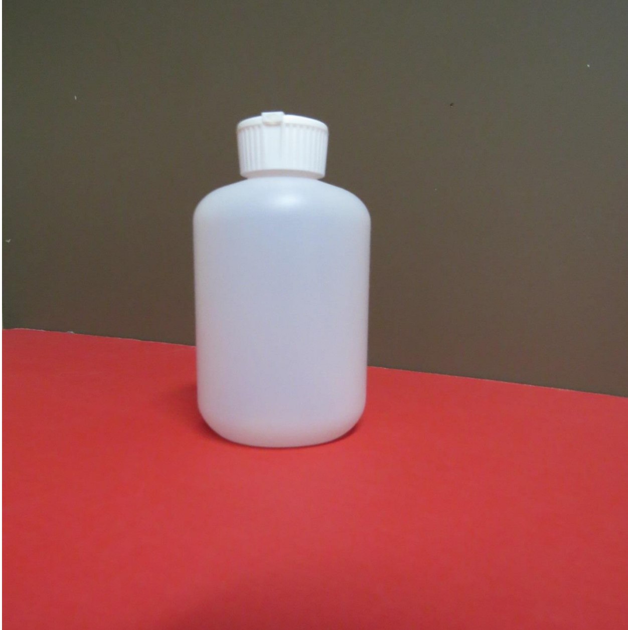
Figure 4-9. Boston Round Bottle with Flip Spout Top