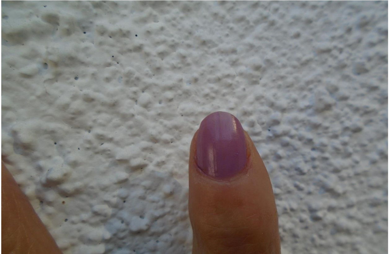
Figure 4-2. Base/Color Coat Applied for Adhesion Testing