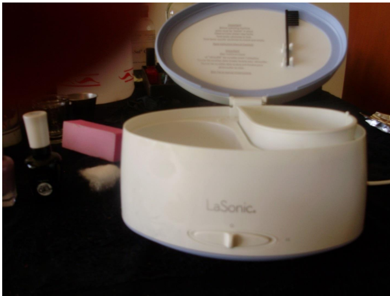
Figure 3-2. Ultrasonic Jewelry Cleaner Used for Testing Water-Based Removers

The ultrasonic system includes a heater and IRTA also conducted removal tests at elevated temperature. In this case, since the hands would have to be placed in the heated formulation, the temperature could be no higher than about 110 degrees F, which is about the highest temperature a person can tolerate. IRTA later conducted a variety of tests in a small ultrasonic jewelry cleaner with a heated formulation. A picture of the jewelry cleaner is shown in Figure 3-2.