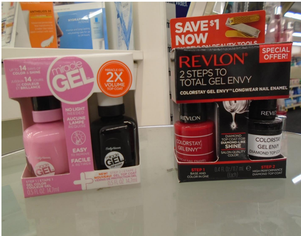
Figure 2-6. Two Brands of Hybrid Nail Polish

This type of polish is a combination of regular polish and light cured polish. The base coat and color coat are made of materials identical to regular polish. The top coat contains acrylic copolymers and is cured with natural light rather than a UV or LED light. The top coat cures quickly in roughly the same time as regular nail polish when it is exposed to natural light. Some brands consist of a color coat and a top coat and others require use of a base coat, a color coat and a top coat. This type of polish is much easier and quicker to apply than gel UV light cured polish. In many cases, the hybrid polishes have the word gel in the name, presumably because the topcoat is cured with light, albeit natural light. A picture of the bottles for two brands of hybrid systems is shown in Figure 2-6. The base/color coat is transparent since it is nitrocellulose lacquer like regular polish (in this case pink or red). The topcoat bottle on the right is opaque so the formulation will not cure until it is applied and encounters natural light.