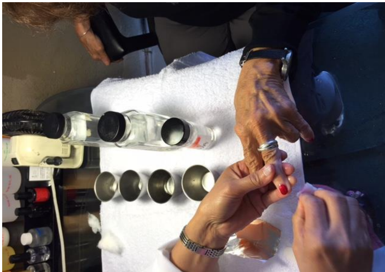
Figure 2-7. Removal Process for Regular Polish in a Salon during Testing

applied. Figure 2-7 shows a picture of a typical removal process for regular polish in a salon during IRTA's testing.