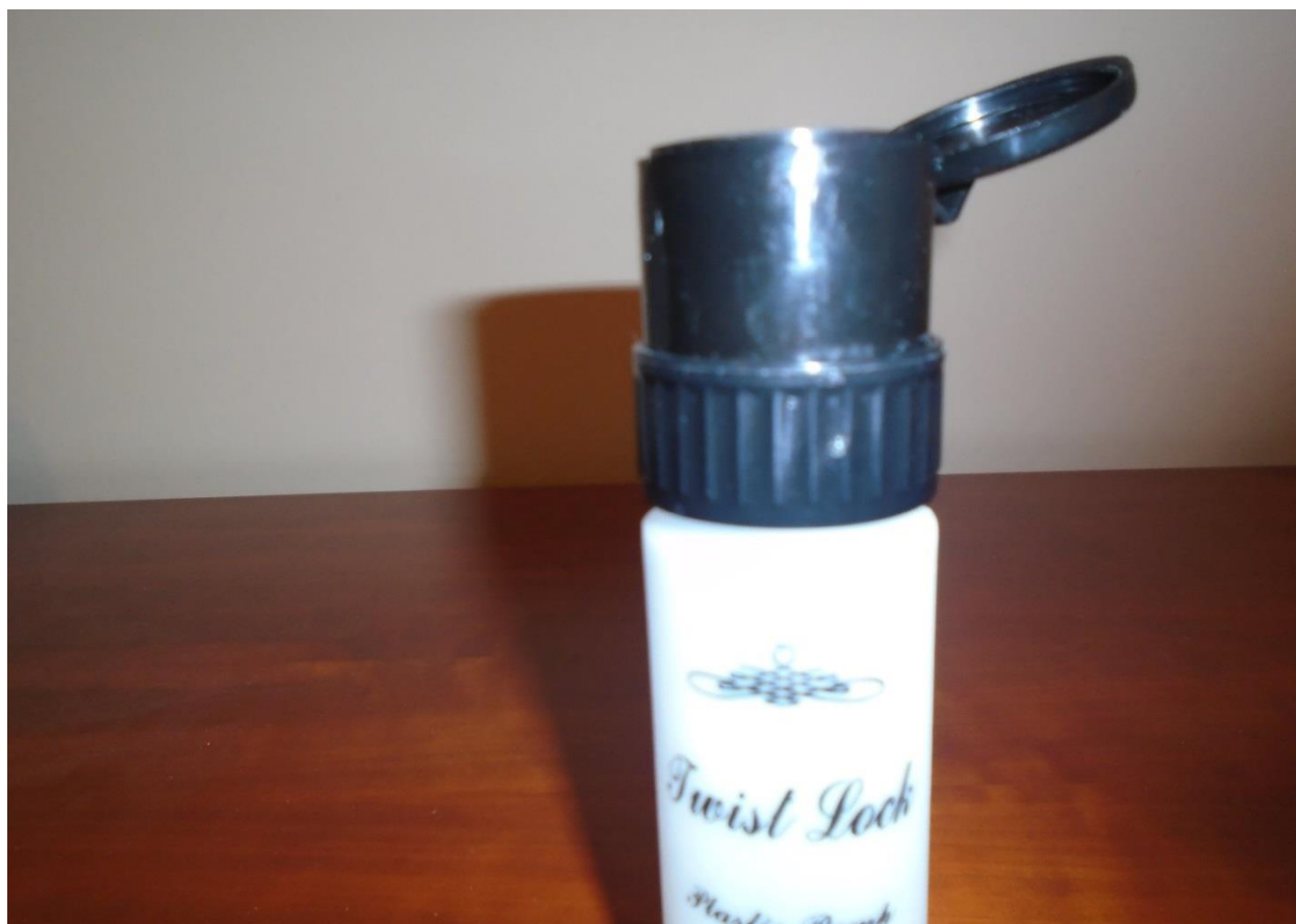
Figure 4-7. Twist Lock Bottle with Top Open

IRTA purchased a few of these bottles with different removers in them. The caps broke easily and couldn't be opened after a few uses for some of the bottles. They also seemed to be wet with liquid often which indicated they were leaking readily. IRTA was wary of using bottles with this type of cap for the alternative removers because of concern about selective evaporation. IRTA believed that the bottles with the flip spout tops used by salons were better for containing the removers.