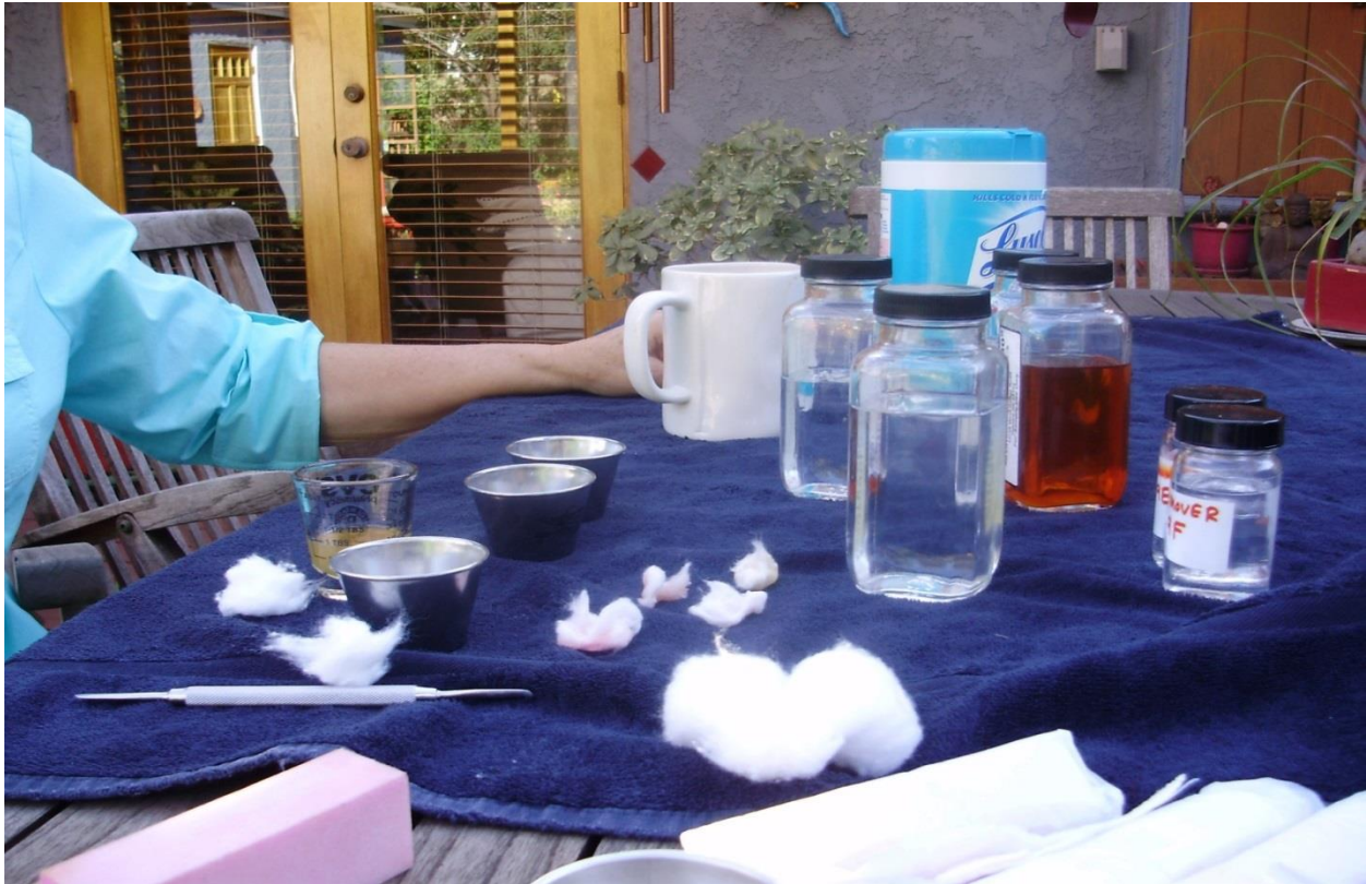
Figure 3-6. Alternative Formulations and Equipment for Tests with Consumers