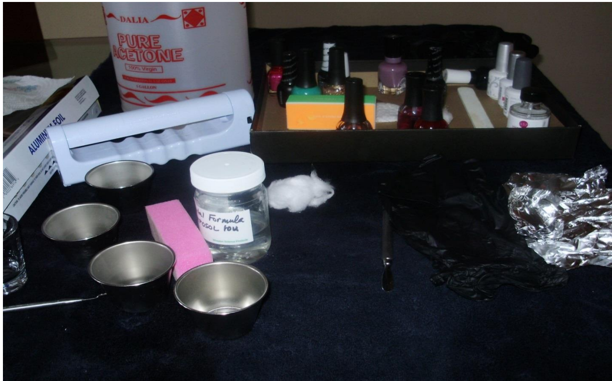
Figure 4-5. Gallon Container of Acetone Purchased by Salons