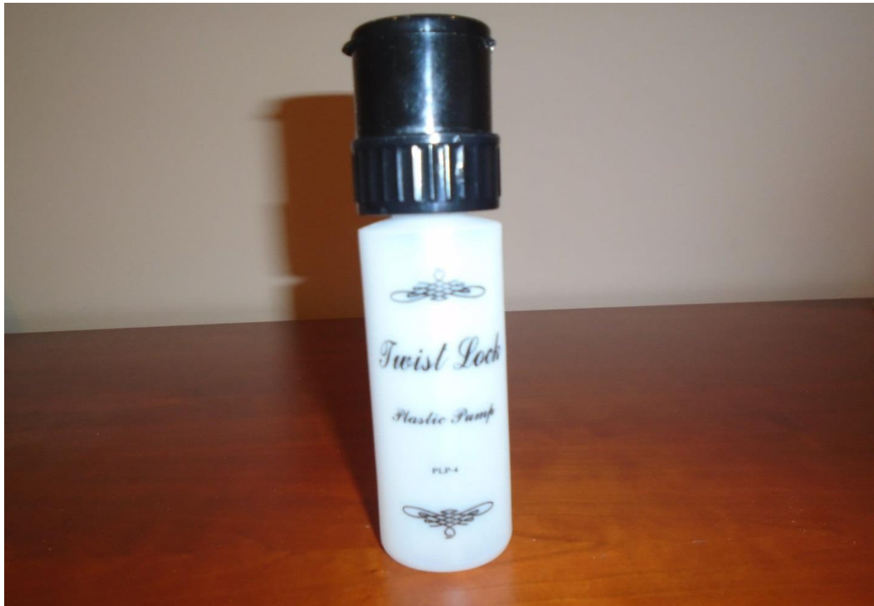
Figure 4-8. . Twist Lock Bottle with Top Closed

IRTA and the formulator IRTA worked with decided to conduct evaporation tests on bottles with the two different types of tops to determine if they varied. The tests were conducted on eight-ounce HDPE bottles with flip spout tops and four ounce HDPE bottles with twist lock tops. These sizes of bottle were selected because they were readily available.