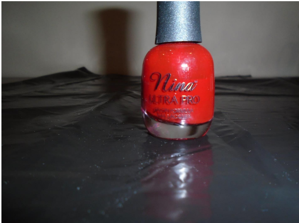
Figure 2-1. Bottle of Regular Nail Polish

This polish type is referred to as regular nail polish and it has been widely used in the market for decades. It is sold in liquid form in small bottles. It is applied to the nails with a small brush and, within a few minutes of application, it forms a shiny coating on the nail and hardens. It is water and chip resistant and may last a few days to a week before removal and reapplication is required. Figure 2-1 shows a picture of a bottle of regular nail polish.