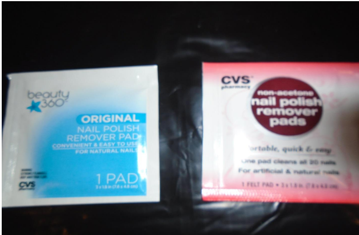
Figure 2-8. Two Types of Polish Remover Pads