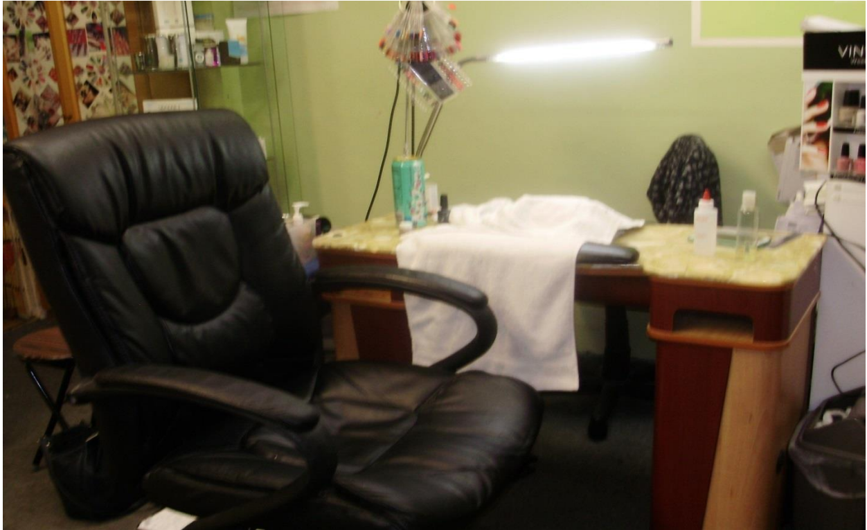
Figure 3-10. Testing Alternatives at Cute Nails