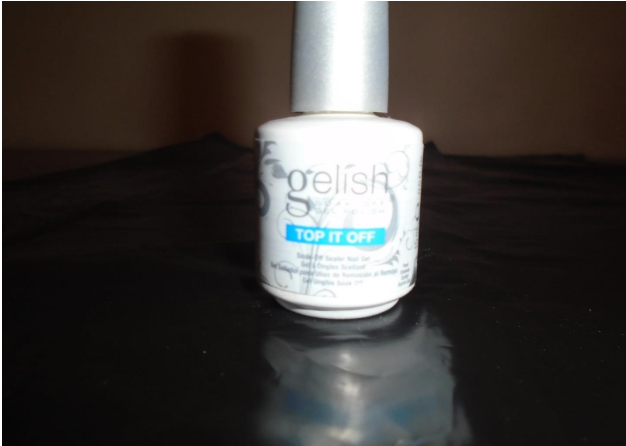
Figure 2-5. Opaque Bottle of Ultraviolet Light Cured Gel Polish Top Coat