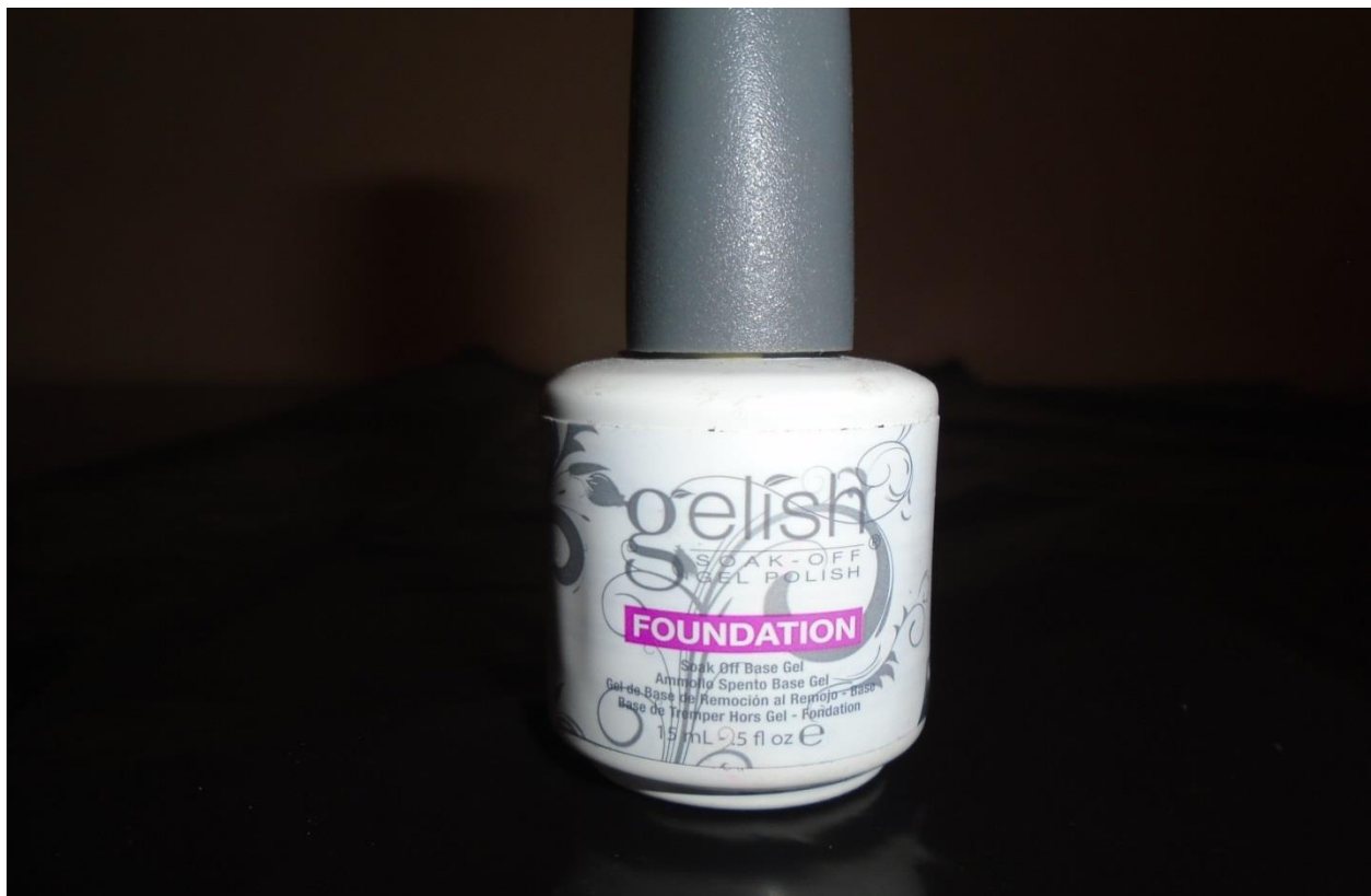
Figure 2-3. Opaque Bottle of Ultraviolet Light Cured Gel Polish Base Coat