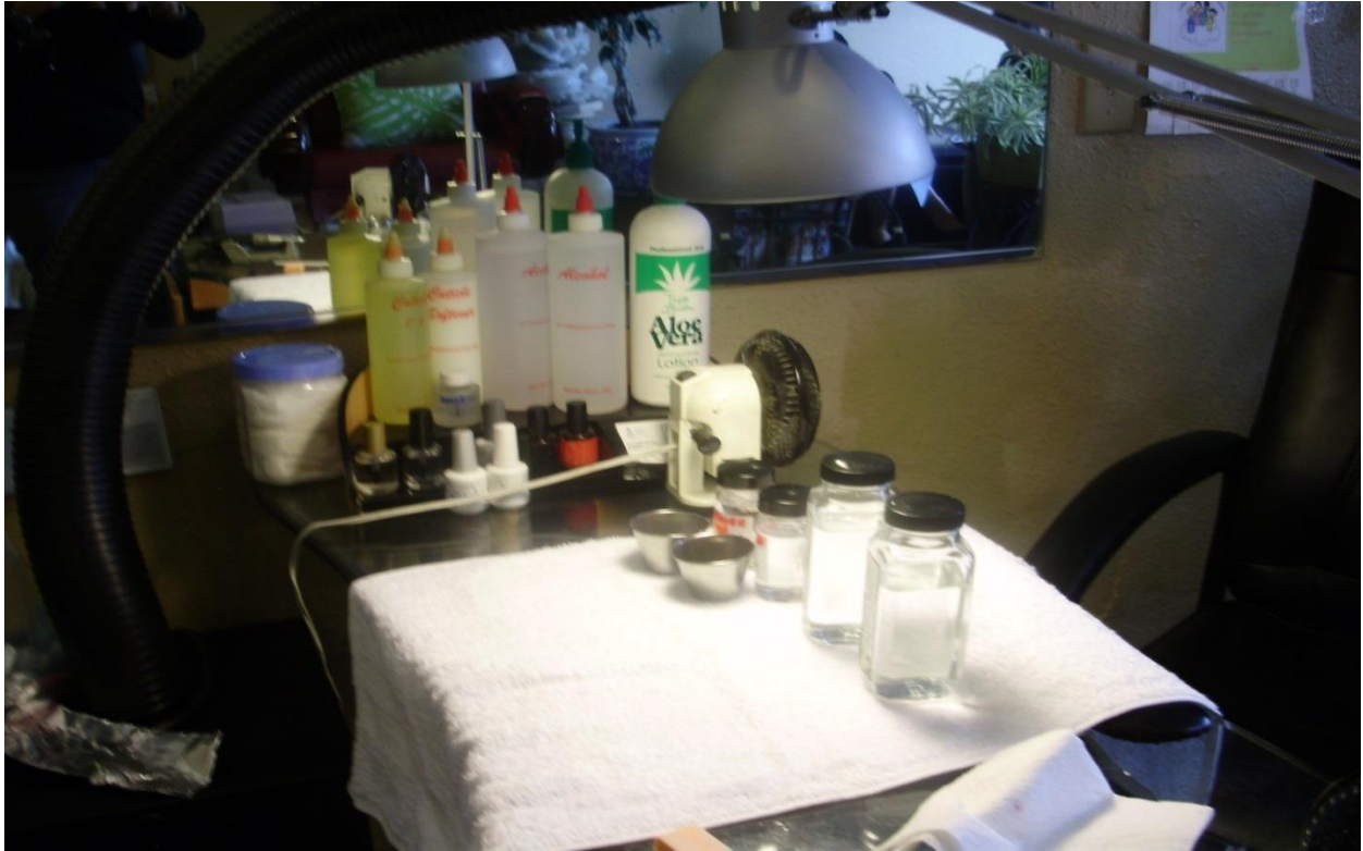
Figure 3-8. Alternative Formulation Testing at Salon