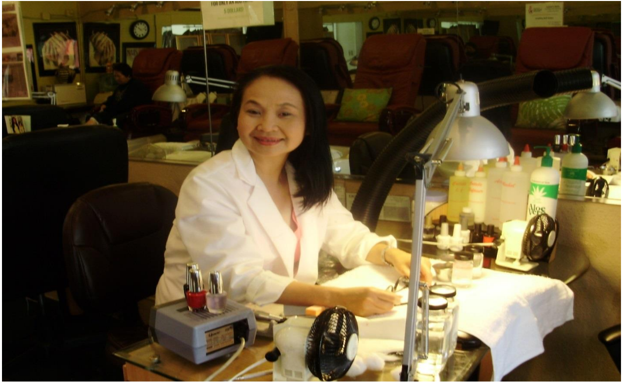
Figure 3-7. Testing Alternatives with Owner at Leann’s Nails