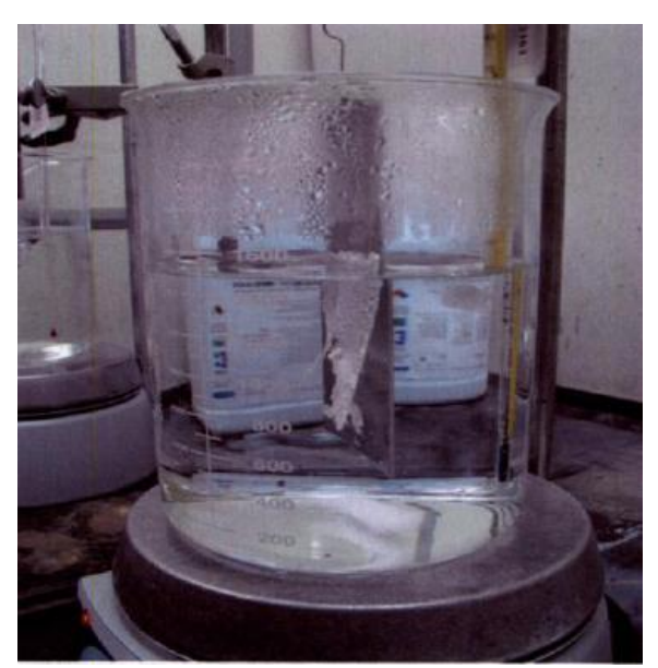
Figure 2-3. Soil Delaminating From Coupon

In general terms, the intermediate soil was the easiest of the three soils to remove. In all cases where the soil was removed, it delaminated from the surface of the coupon in a sheet, most often within five minutes and floated to the top of the solution where it dissolved. Figure 2-3 shows an example of the soil delaminating from the coupon and Figure 2-4 shows it floating to the top of the beaker.