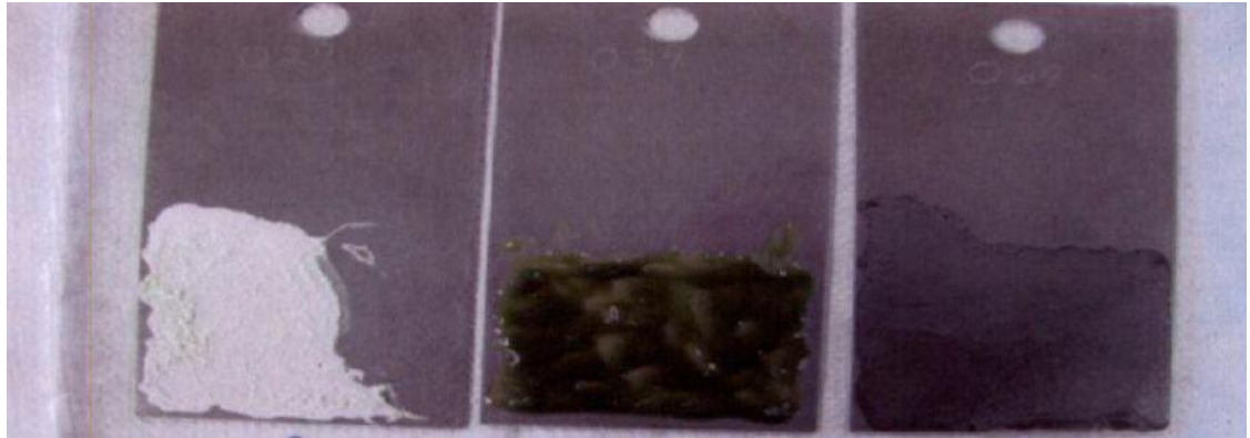
Figure 2-1. Test Coupons With Three Soils

The coupons were weighed on an analytic balance before they were soiled. They were coated with the soil and then baked for seven days, placed in a dessicator and weighed again. The difference between the weight before soiling and after soiling is the weight of the soil. Examples of coupons with the AMPAC intermediate, oil and grease and carbon from left to right are shown in Figure 2-1.