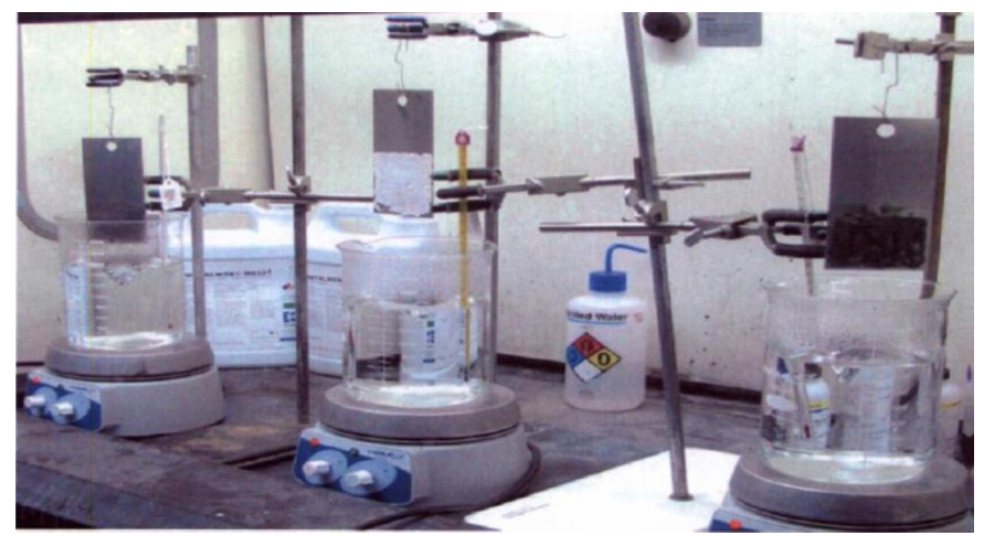
Figure 2-2. Beaker Setup For Coupon Tests